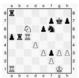
33 ... Rb5-b2. The alternative 33 ... Rb5xc5 34. d4xc5 Nf6-e4 35. Ra1xa5 Ra8xa5

22 ... g5-g4 23. Bf3-d1 Bb5c6 24. Rb1-c1 Bc6-e4 25. Nb2-a4 Rb8-b4 26. Nc4-d6 Be4-f327. Bd1xf3 g4xf3 28. Nd6-c8 Ra7-a8 29. Nc8-e7+ Kg8-g7 30. Ne7-c6 Rb4-b3 31. Na4-c5 Rb3-b5 32. h2-h3 Nd7xc5 33. Rc1xc5